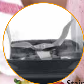
Stainless steel 4 Blade