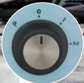
2 Speed & Pulse