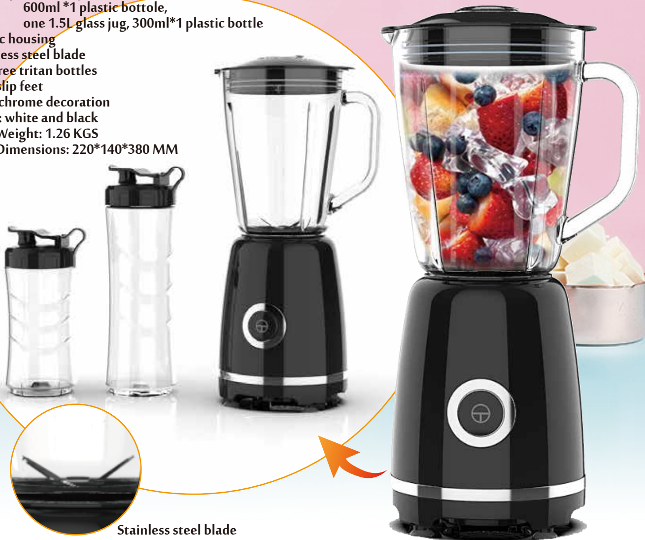
Stainless steel blade