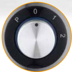
2 Speed & Pulse