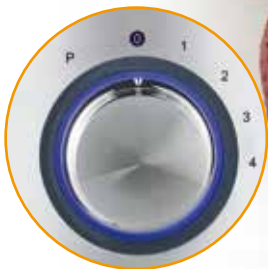
4 speeds electronic switch with pulse feature