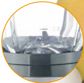
Stainless Steel Blades