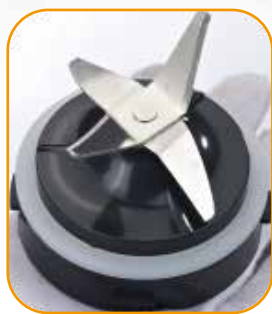
Removable stainless steel 4 Blade