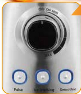
3 function buttons With blue LED light