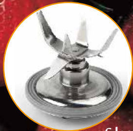
6 leaves stainless steel