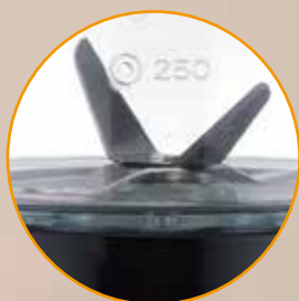
Removable stainless steel 4 Blade