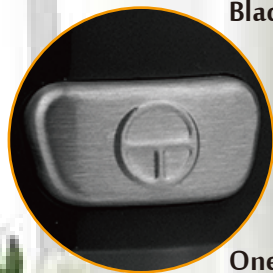
One Button Operation