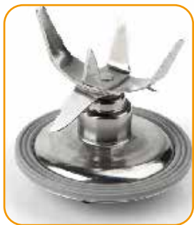
6 leaves stainless steel