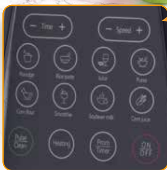
Smart digital display