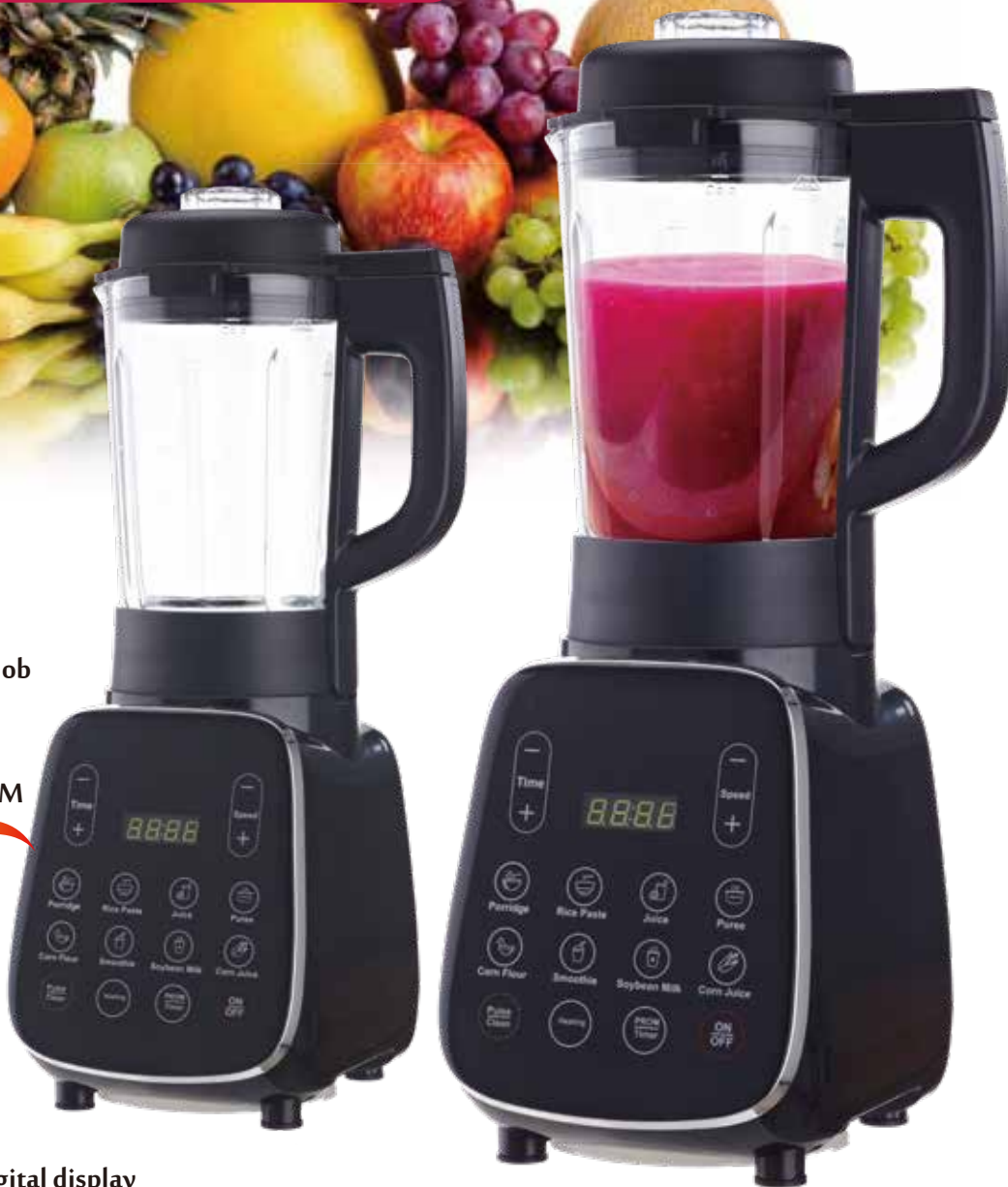
Smart digital display