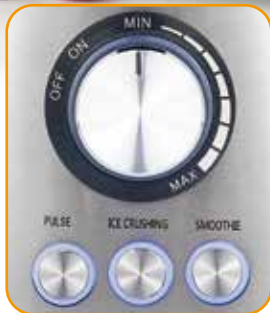
3 function buttons With blue LED light