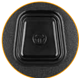
One Button Operation