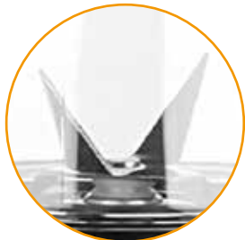
Stainless steel Blade