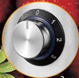
3 speed control With blue LED light