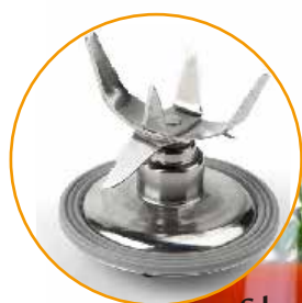
6 leaves stainless steel