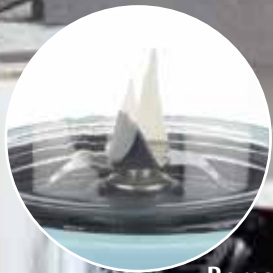
Removable stainless steel 4 Blade