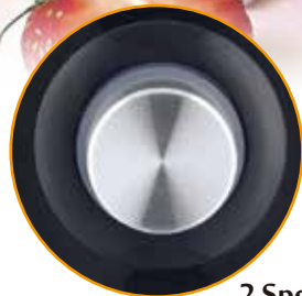
2 Speed & Pulse