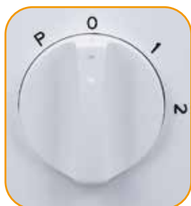
2 Speed & Pulse