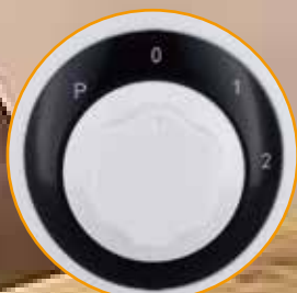
2 Speed & Pulse