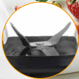
Stainless steel 4 Blade