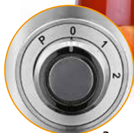
3 speed control With blue LED light